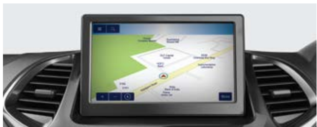
TOUCHSCREEN WITH NAVIGATION