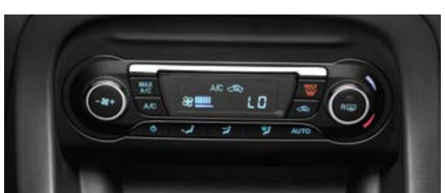
AUTOMATIC CLIMATE CONTROL