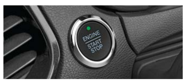
PUSH BUTTON START