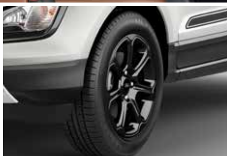
R16 (205/60 R16) Sporty Alloy Wheels