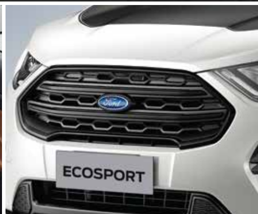
Bold Black Front Grille