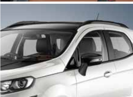
Electric Sunroof with Black Roof Rails