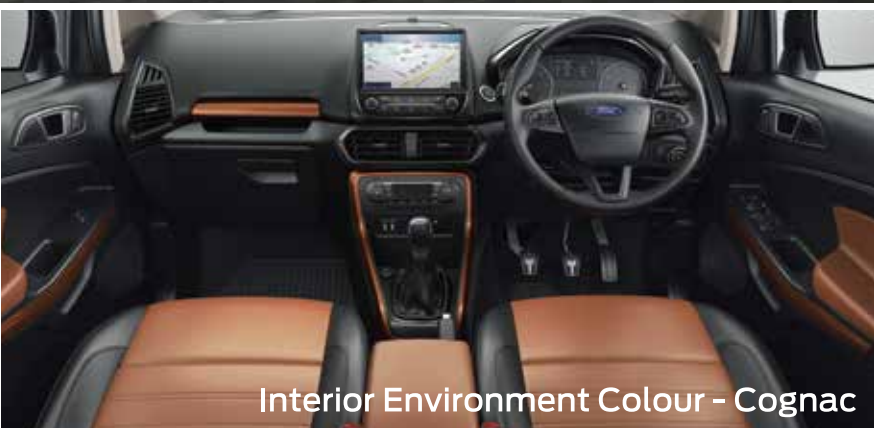
Interior Environment Colour - Cognac