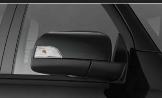
Ebony Black Side Mirrors