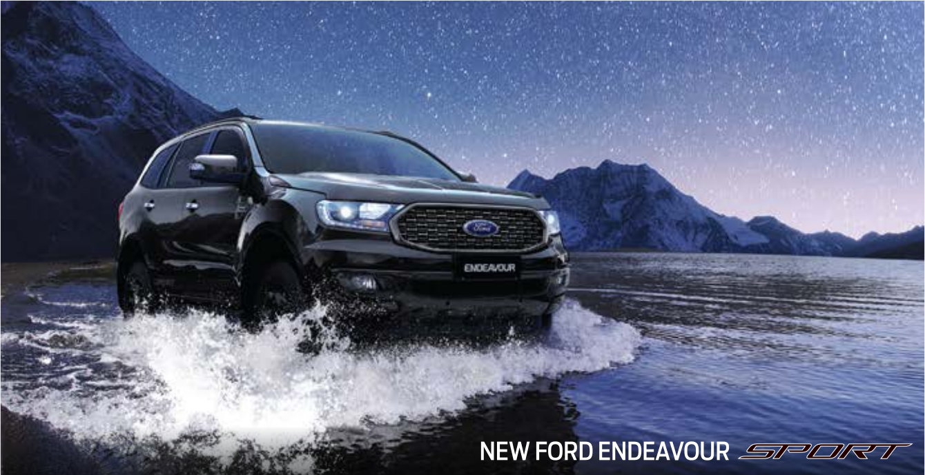
NEW FORD ENDEAVOUR SPORT