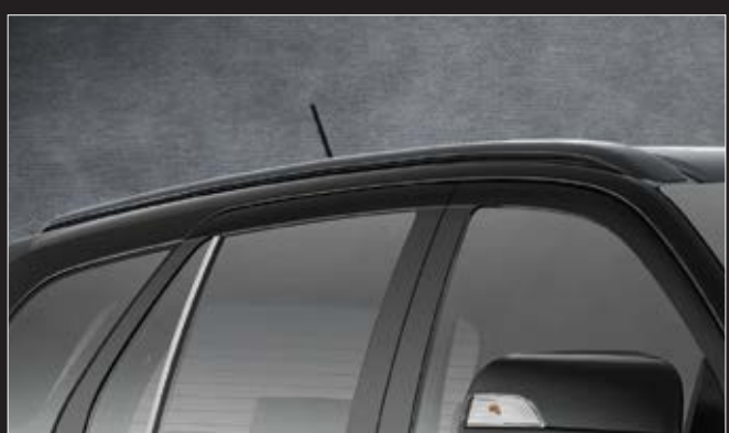
Ebony Black Roof Rails