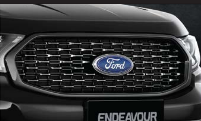
All New Ebony Black Front Grille