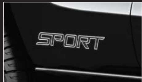
SPORT decal on Doors & Tailgate