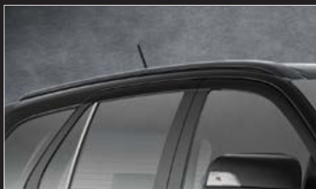
Ebony Black Roof Rails