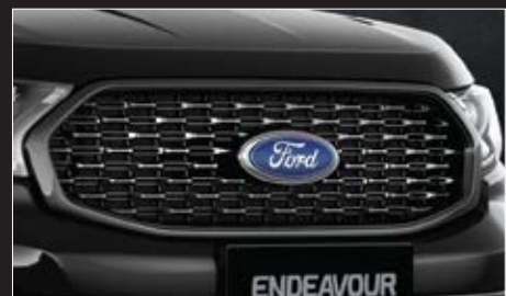
All New Ebony Black Front Grille