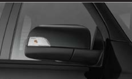
Ebony Black Side Mirrors