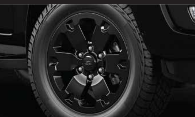
Ebony Black Premium Alloy Wheels