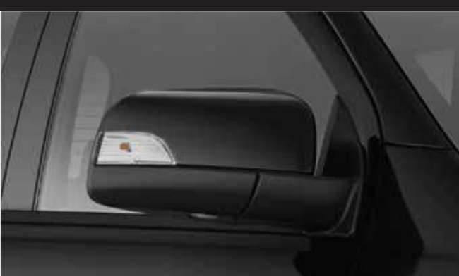
Ebony Black Side Mirrors