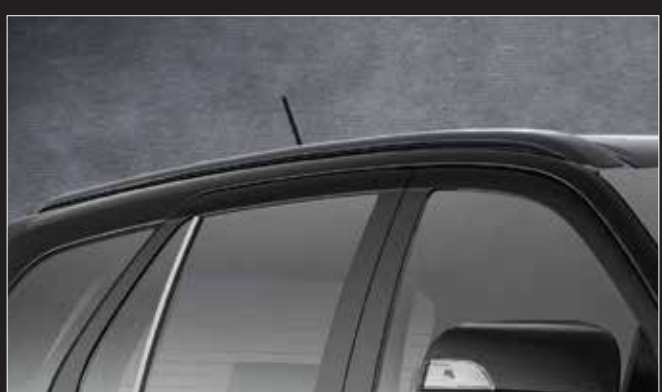
Ebony Black Roof Rails