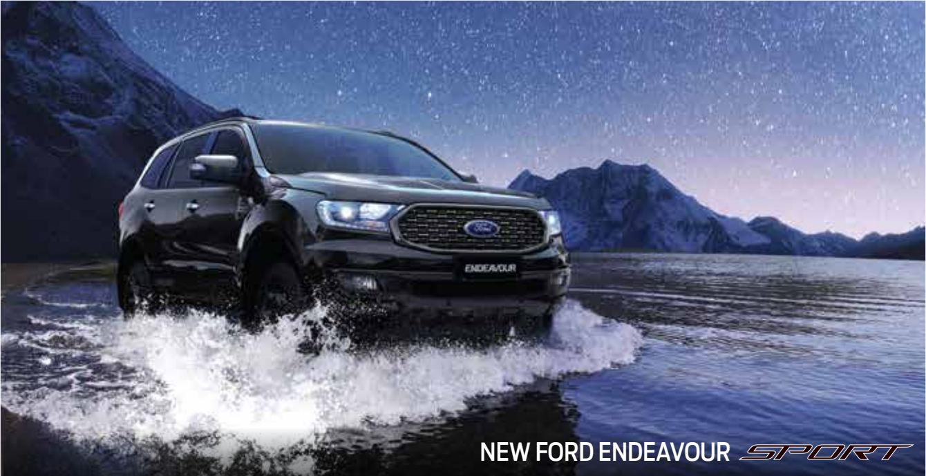
NEW FORD ENDEAVOUR SPORT