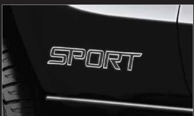
SPORT decal on Doors & Tailgate