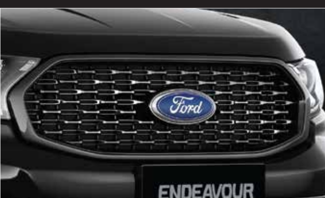
All New Ebony Black Front Grille