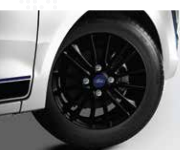
R15 (195/55 R15) Alloy Wheels Stand apart from the crowd as you zip through roads with these stylish R15 alloy wheels.