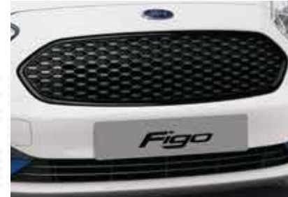
Sporty Cellular Grille The sporty cellular grille gives a smart, bold look to the Ford Figo.

Dual Tone Roof Contrasting colours on the roof make the Ford Figo a sight to behold.