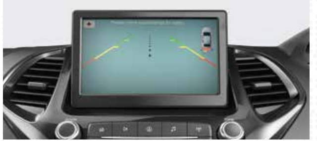
Rear-View Camera When you reverse, the rear-view camera automatically turns on, giving you a clear view of what's behind.