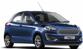
Deep Impact Blue