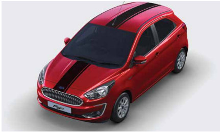
Body Stripe Kit

Make your New Ford Figo stand out from the crowd with our range of accessories.