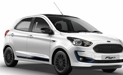
New Figo Titanium BIU - Oxford White