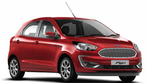
New Figo Titanium - Ruby Red