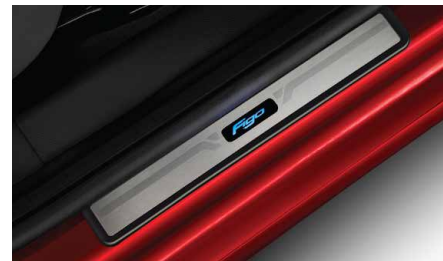
Illuminated Scuff Plate