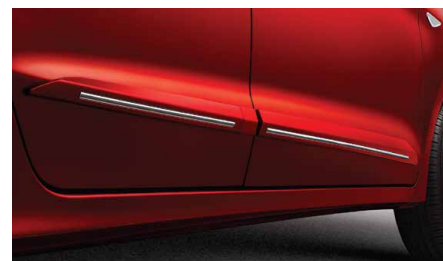
Chrome Body Side Protection Moulding

Not applicable for variants with side & curtain airbags.